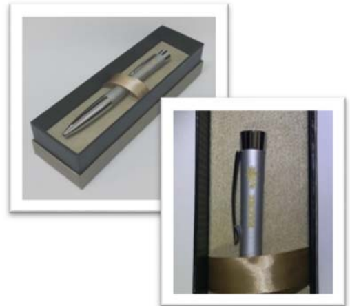
Stainless Steel Parker Pen: $45 Ballpoint pen, engraved with "RAEME" and the Corps Logo

The RAEME Corps Flag: $395 Dimensions: 1800×900 mm Manufacturer: Carroll & Richardson