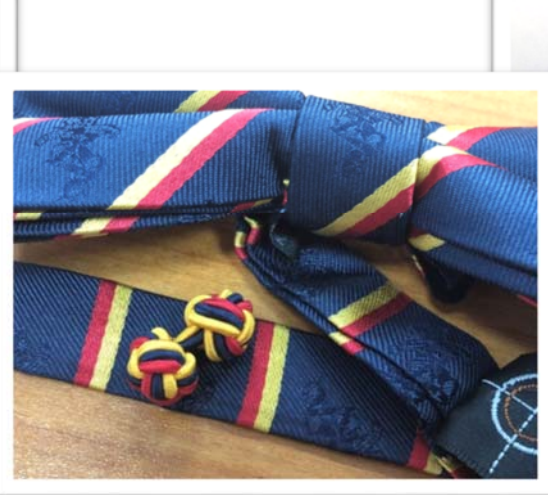
RAEME Silk Tie and Bow Tie: $30