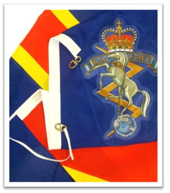
The RAEME Corps Flag: $395 Dimensions: 1800×900 mm Manufacturer: Carroll & Richardson