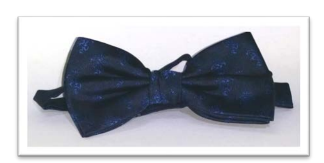
RAEME Bow Tie: $30 RAEME bow tie in dark blue with embroidered Corps Logos in Union Jack Blue. In polyester with pre-tied knot and metal clasp attachment.

Email the <u>Head of Corps Cell</u> to purchase. Postage to a military workplace is free of charge. Postage to a civilian address will incur an extra charge — approximately $14.00.