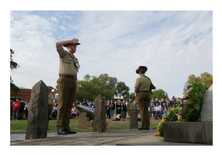
ANZAC Day

ANZAC Day at Rutherglen. ASEME paraded the RAEME Banner at Rutherglen, with LTCOL Bouloukos, CSM addressing the gathering and laying a wreath.