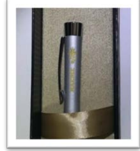
Stainless Steel Parker Pen: $30 Ballpoint pen, engraved with "RAEME" and the Corps Logo