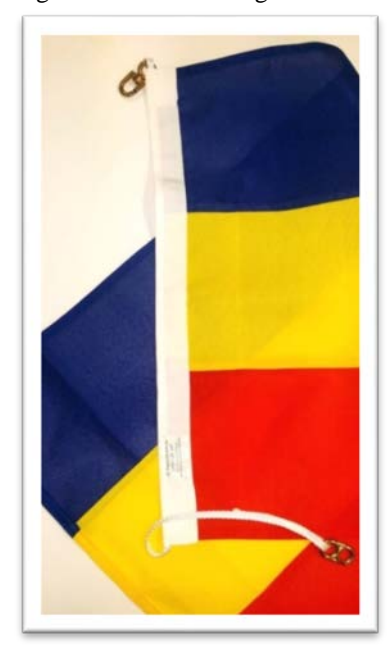
The Flag, Identification, Workshop: $125 Dimensions: 900×600 mm Manufacturer: Carroll & Richardson

The RAEME Flag and the Flag, Identification, Workshop (Tricolour) for sale are designed and constructed in accordance with the Army Ceremonial and Protocol Manual and RAEME Corps Instructions. The flags are fully sewn and feature metal fitments. The RAEME Flag is constructed using the new RAEME logo.