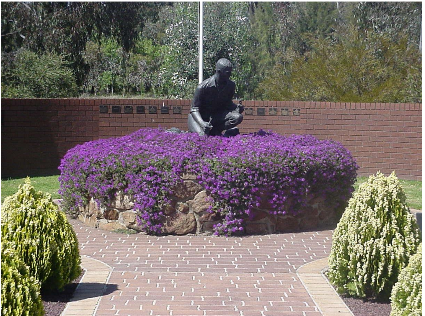
Figure 1: Craftsman Memorial