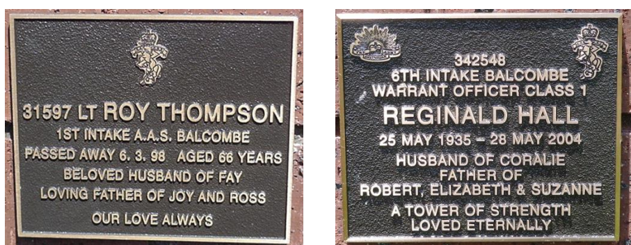
Figure 2: Examples of Memorial Plaques placed on the wall