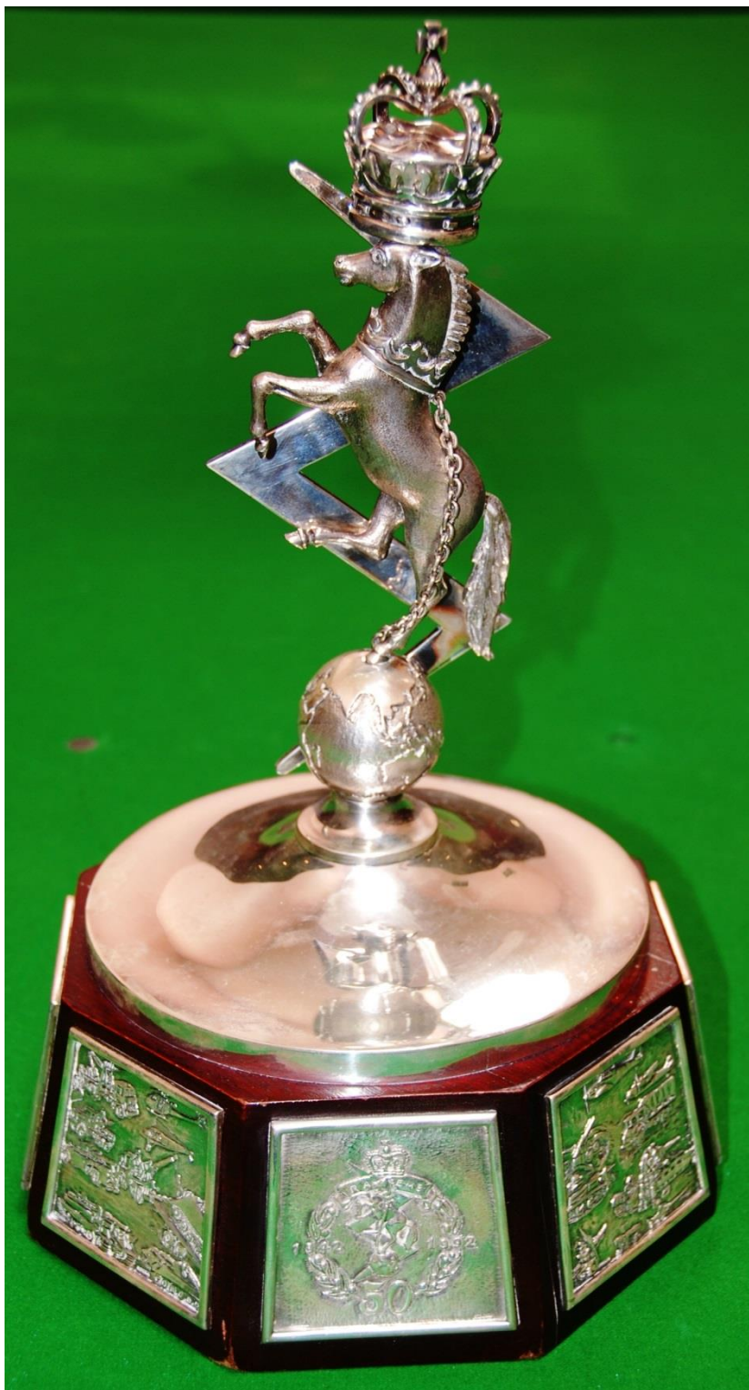
Fig 1: The RAEME Corps Centrepiece - Photo